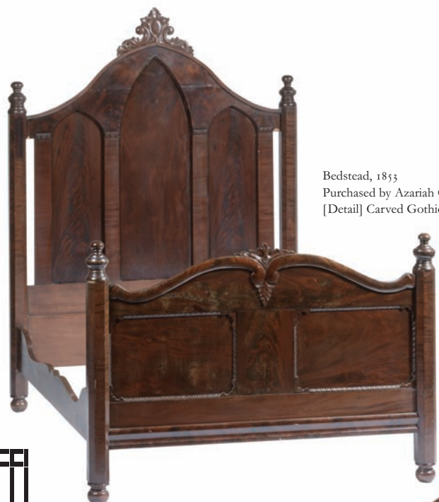
Bedstead, 1853 Purchased by Azariah Graves, Caswell County [Detail] Carved Gothic arches