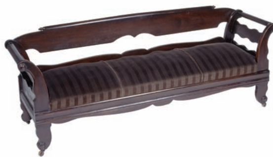
Lounge, 1858 Crafted for Governor David S. Reid [Detail] S-scrolled front stile and foot