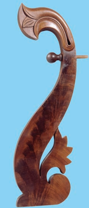
Bureau, 1855 Owned by Governor David S. Reid [Detail] Pillar and scroll mirror supports