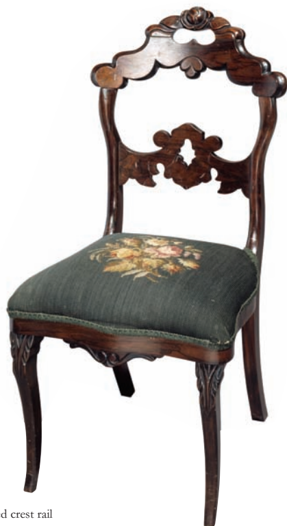
Side chair, ca. 1850 [Detail] Ballon back and carved crest rail