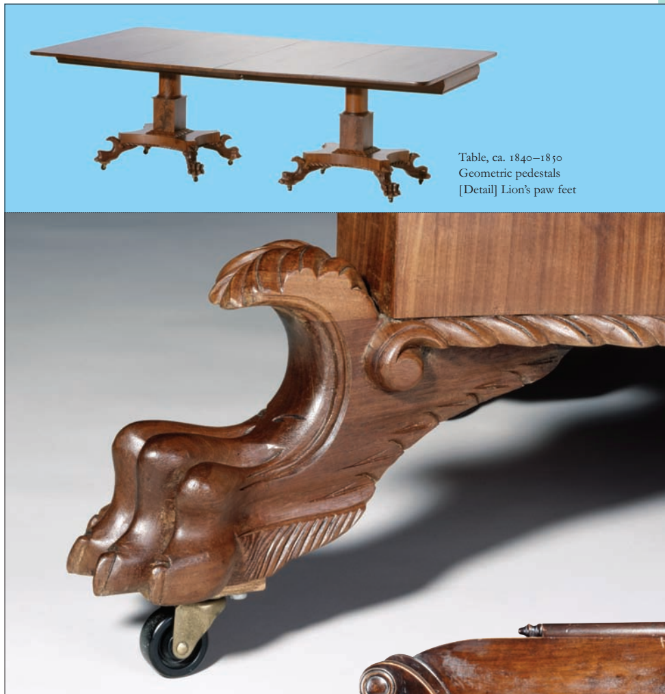
Table, ca. 1840–1850 Geometric pedestals [Detail] Lion's paw feet